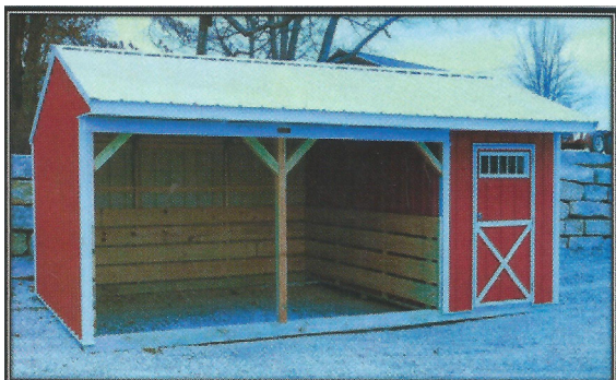
Shown with optional transom window in Dutch door

6' TACK ROOM OPTIONS 10' widths - $550.00 12' & 14' widths - $665.00