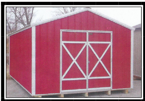
"Value For Your Dollar"