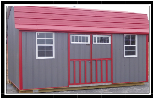
Shown with optional transom windows in classic door